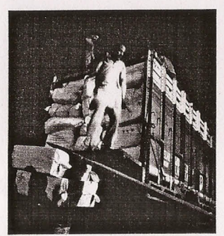
△ India-based Patel Roadways is now one of the largest road transportation companies in Asia.