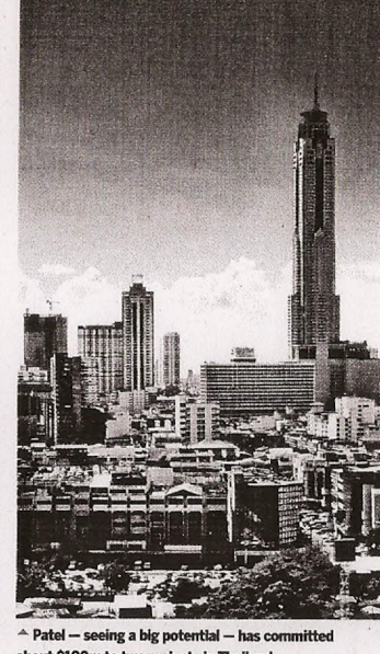
about $100m to two projects in Thailand.

high rate of 28 percent to buy one lorry, which swiftly turned into a trucking empire.