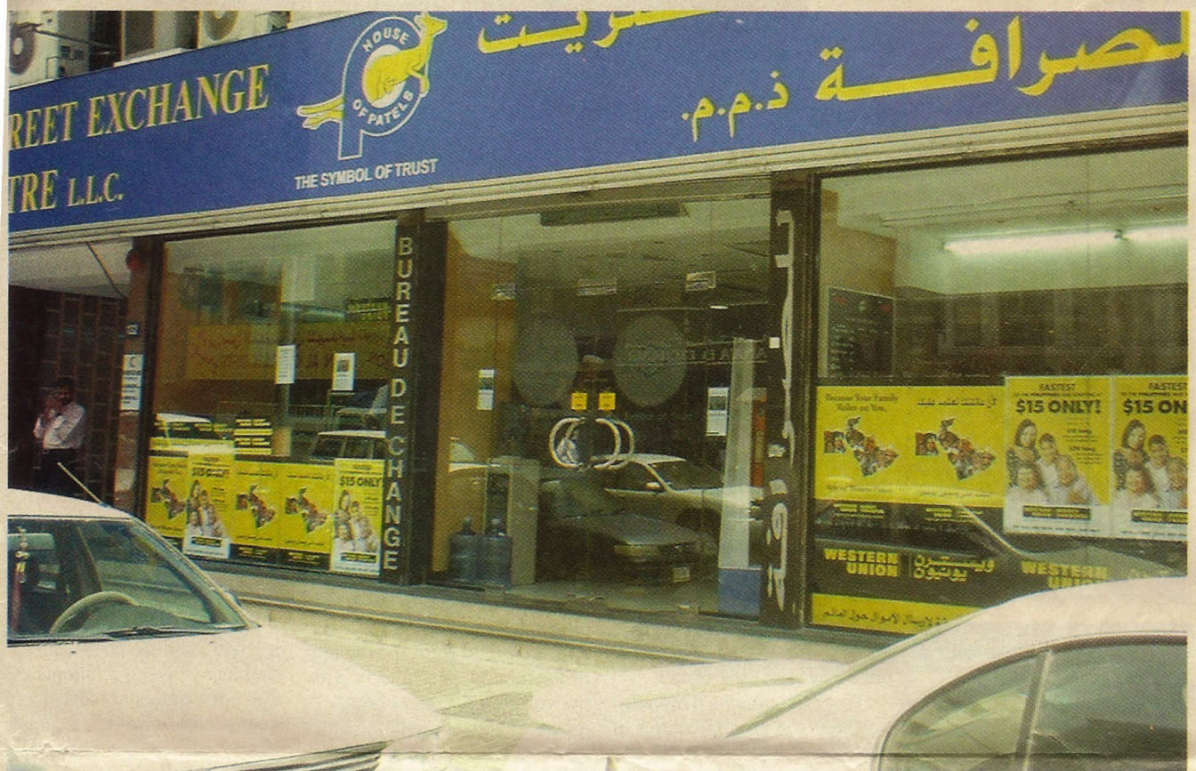
Wall Street Exchange Centre — Naif branch