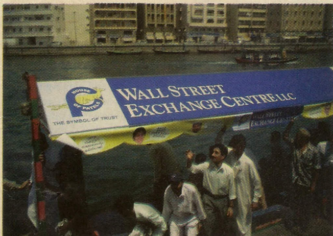
A canopy provided by Wall Street Exchange Centre adds colour to Dubai's Abra water taxi

Wall Street Exchange Centre also deals with Currency imports and exports from various countries within the Middle East, Europe, Asia and Africa. The surplus currencies after sorting and counting are then re-exported to various countries like the UK, Switzerland, Hong Kong, Saudi Arabia, Bahrain, Kuwait, Qatar etc.